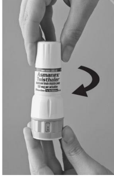
Figure F: Closed TWISTHALER

This is the only way to be sure that your next dose is properly loaded.