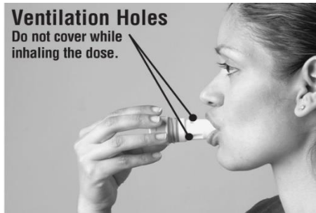
Figure D: Inhalation