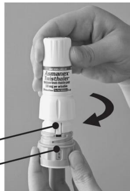
Figure E: Closing the TWISTHALER