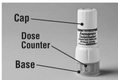
Figure A: TWISTHALER (upright position)